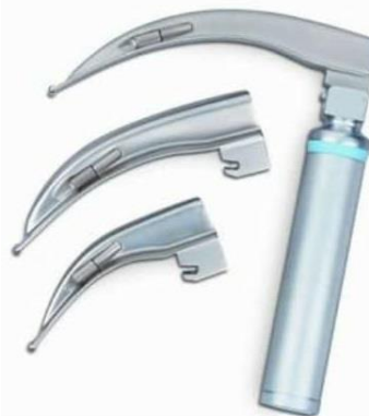
Macintosh Laryngoscope with 4 blades