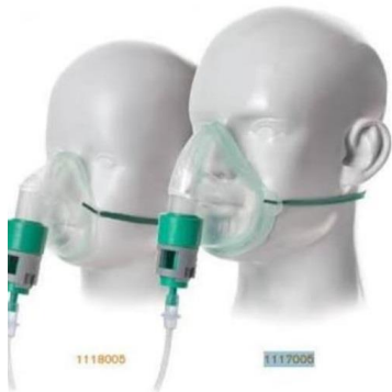
MultiOx Adjustable Venturi Mask