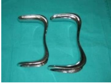
Sims Vaginal speculum