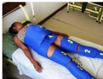
Non-pneumatic anti-shock garment