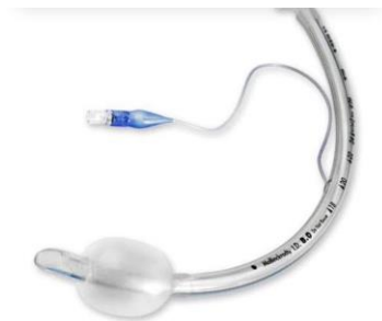
Endotracheal tube cuff